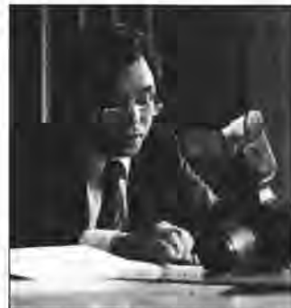
Ichiro Ogimura

Ichiro Ogimura: "In Seoul, 64 men and 48 women could take part in the singles, we would like 128 each; and in addition to the doubles also a