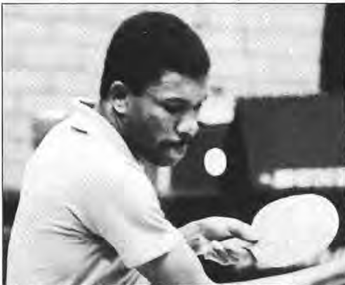
DESMOND DOUGLAS the popular England no.1