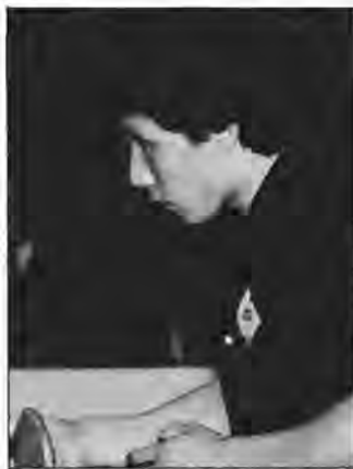
DING YI is England's most dangerous stumbling block when we travel to Austria in January. He will almost certainly play in four of the seven games.